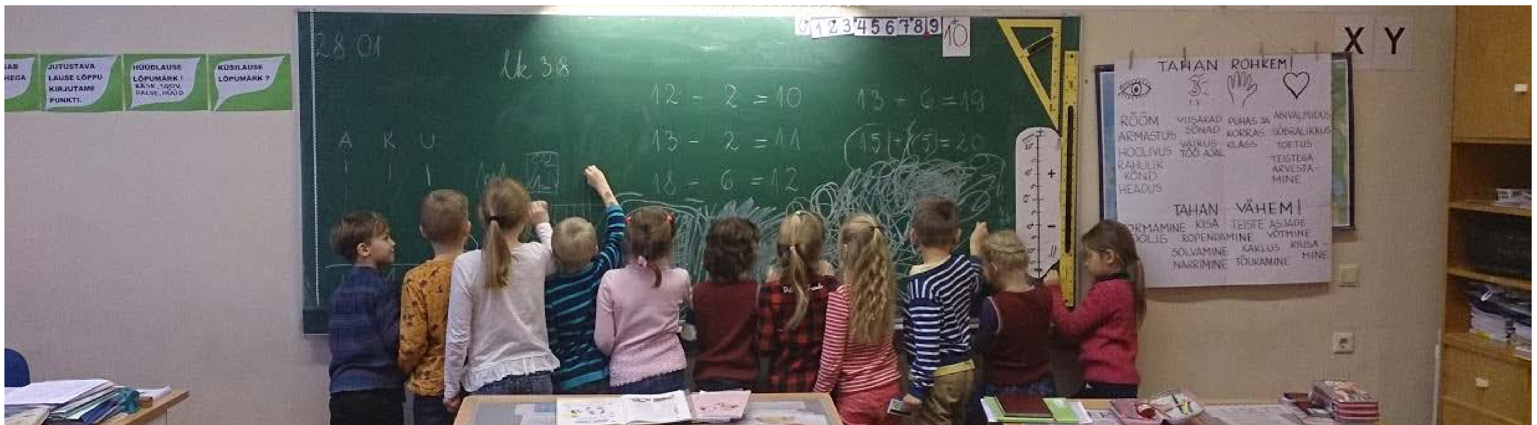
Figure 1. Students have received intrinsic motivator as a reward for cooperative behaviour and can scribble on the chalkboard